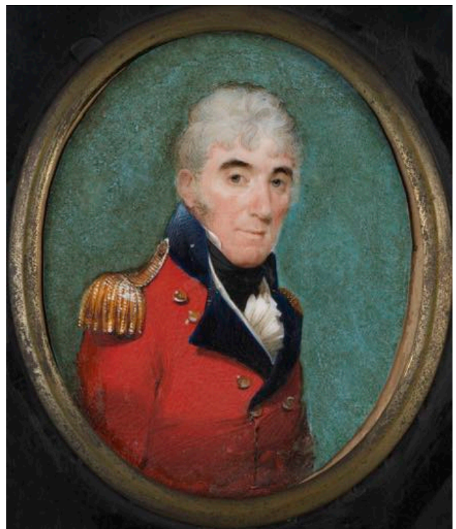
Miniature portrait of Judge Advocate Naval Lt. David Collins by J. Beaumont in 1797. Collins' diaries are essential to our knowledge of these times. In 1802 he became the Lt. Governor of Van Diemen's Land.