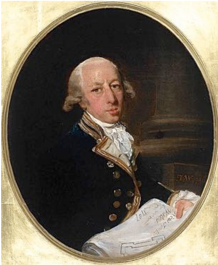
Francis Wheatley's portrait of Captain Arthur Phillip holding his plans for New South Wales in 1787, prior to the departure of the First Fleet from Portsmouth. Phillip was the colony's first Governor (1788-1792) and is commemorated as the Founder of Modern Australia.