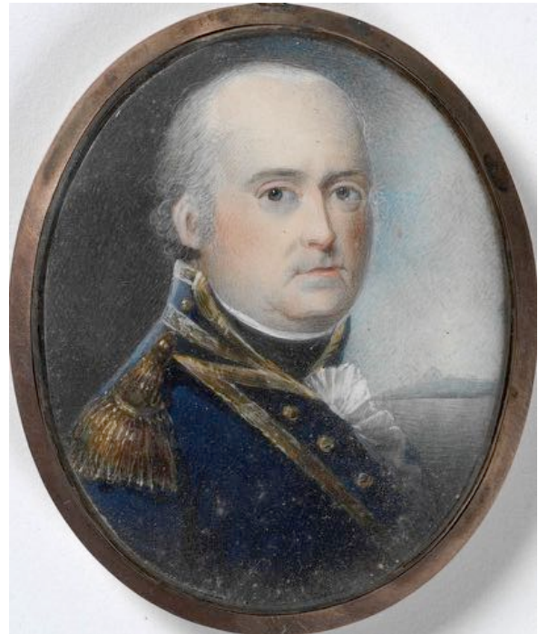
Miniature of Philip Gidley King, the colony's third Governor (1800-1806). He arrived on the First Fleet, and became the first Lt. Governor of Norfolk Island.