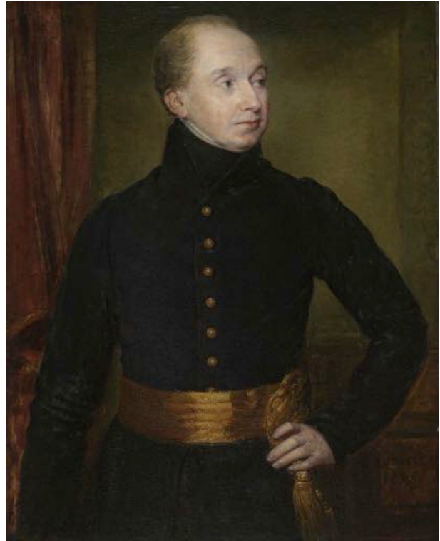
Portrait of Ralph Darling by J. Linnell, colony's seventh Governor (1825-1831). An authoritarian who enforced the punishment of convicts advised by the Bigge report.