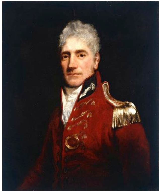
Portrait of Lachlan Macquarie, the colony's fifth and longest serving Governor (1810-1821). Because of his generosity and industry he is often referred to as the Father of Australia. Painted by Graham Gilbert.