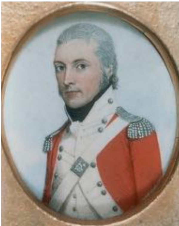
Miniature portrait of Captain Watkin Tench who was with the Marines aboard the Charlotte in the First Fleet. He was a very important chronicler of the FF and colony.