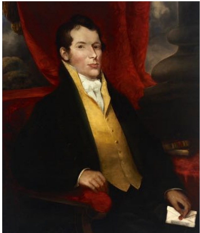
Portrait of John Macarthur who instigated the rebellion against Gov. Bligh. He was a thorn in the sides of all Governors, except Ralph Darling, until he died in 1834.