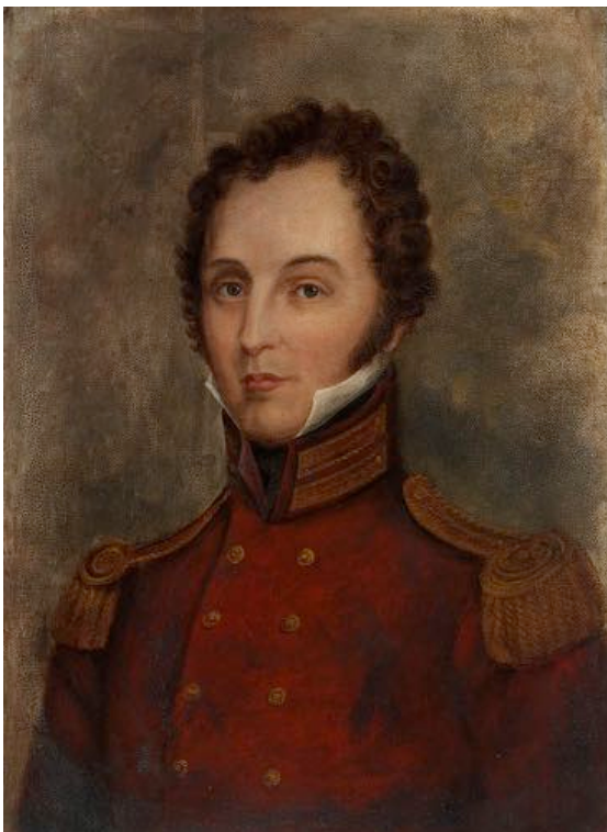
Portrait of Richard Bourke, colony's eighth Governor (1831-1837). A Whig supporter, he assisted small settlers and reduced convict punishments.