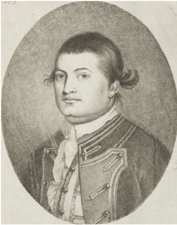
Portrait of NSW Corps Major Francis Grose who became Acting Governor for 2 years after Arthur Phillip left prematurely. During his weak administration the NSW Corps ruled the colony.