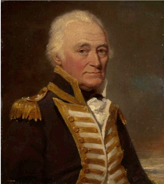
Portrait of John Hunter, the colony's second Governor (1795-1800), by W.M. Bennett. Under his command the second division of the First Fleet sailed into Botany Bay.