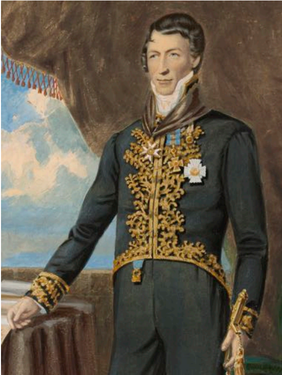
Portrait of Sir Thomas Brisbane, colony's sixth Governor (1821-1825) by Augustus Earle. He was expected to apply the Bigge report and had a keen interest in astronomy.